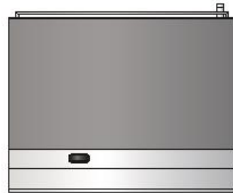
Stainless steel knobs